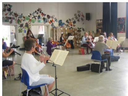
In full swing!